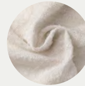
Off White 11