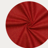
Red Orange 20