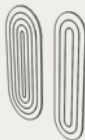
Hanging Acoustic A (includes Aluminium channel and two suspension kits)