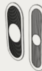
Hanging Acoustic E (includes Aluminium channel and two suspension kits)