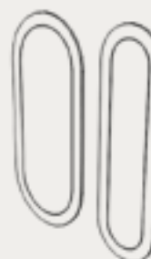
Hanging Acoustic F (includes Aluminium channel and two suspension kits)