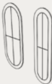
Hanging Acoustic D (includes Aluminium channel and two suspension kits)