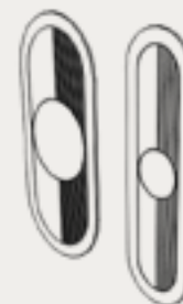
Hanging Acoustic B (includes Aluminium channel and two suspension kits)