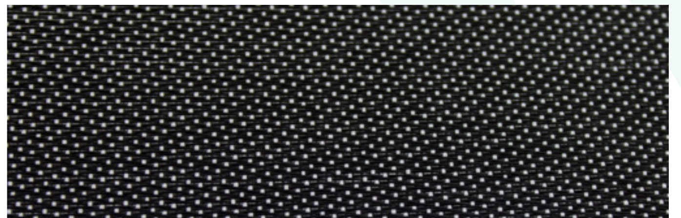
White / Charcoal