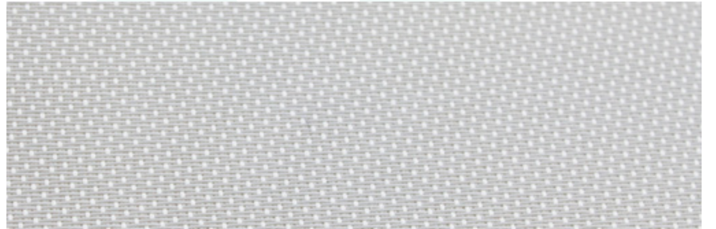
White / Pearl