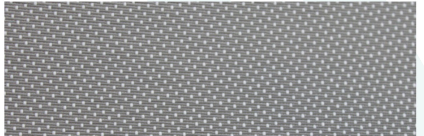
White / Grey