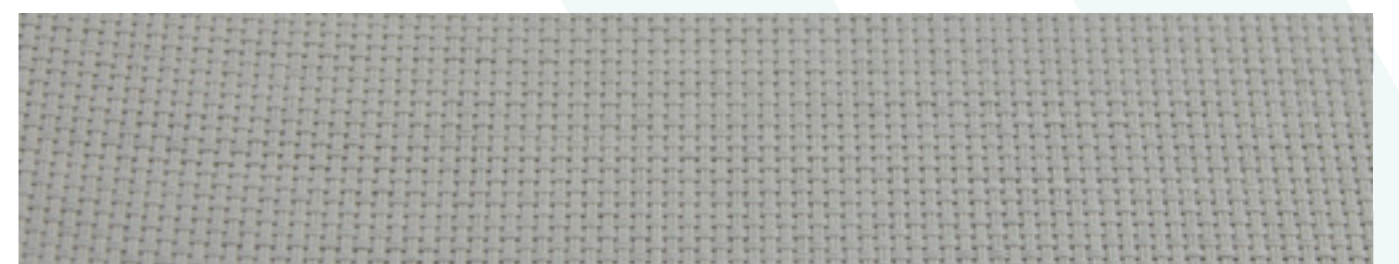
Pearl / Pearl