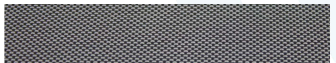
Black / Pearl