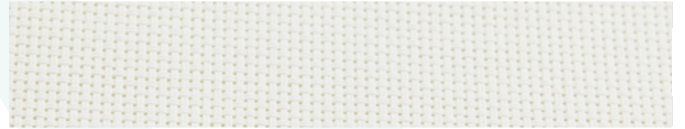
White / White