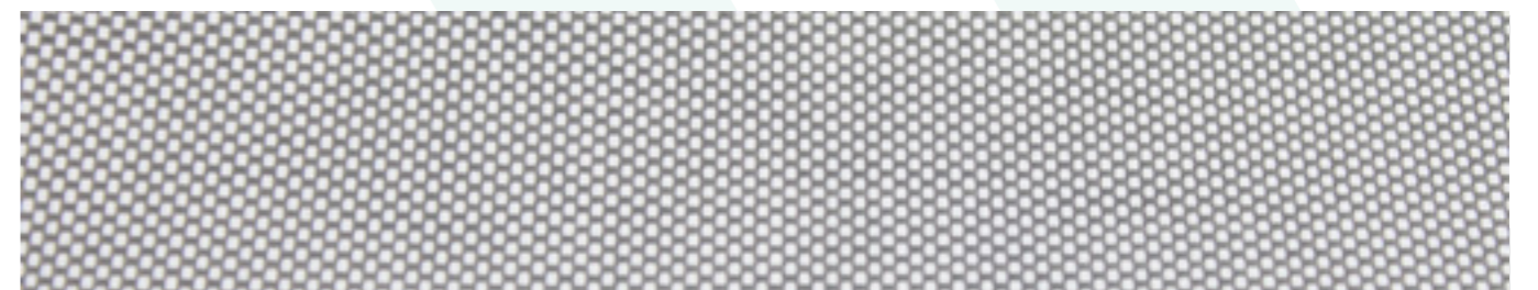
White / Grey