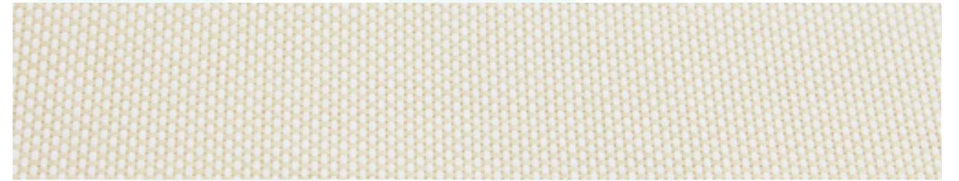
White / Linen